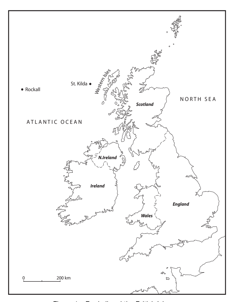
Figure 1 - Rockall and the British Isles

who lost their ship at Rokol in the year 1686, and came in, in a pinnace to St. Kilda ... Upon their landing they pointed to the west, naming Rokol to the inhabitants, and after that, they pointed downward with their finger, signifying the sinking and perishing of their vessel; they shewed them Rokol in the sea map, far west off St. Kilda.