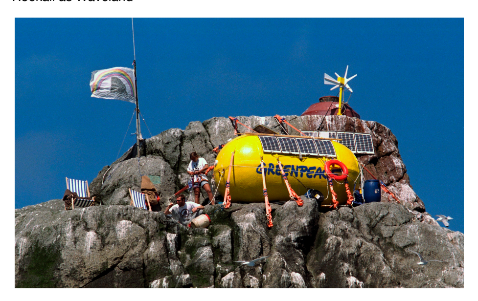
Figure 5 - Greenpeace on Rockall/Waveland, 1997 (Greenpeace)

On 10 June 1997 Al Baker, Meike Huelsman and Peter Morris, members of the environmental pressure group, Greenpeace occupied Rockall. Morris (2007) later stated in a blog that