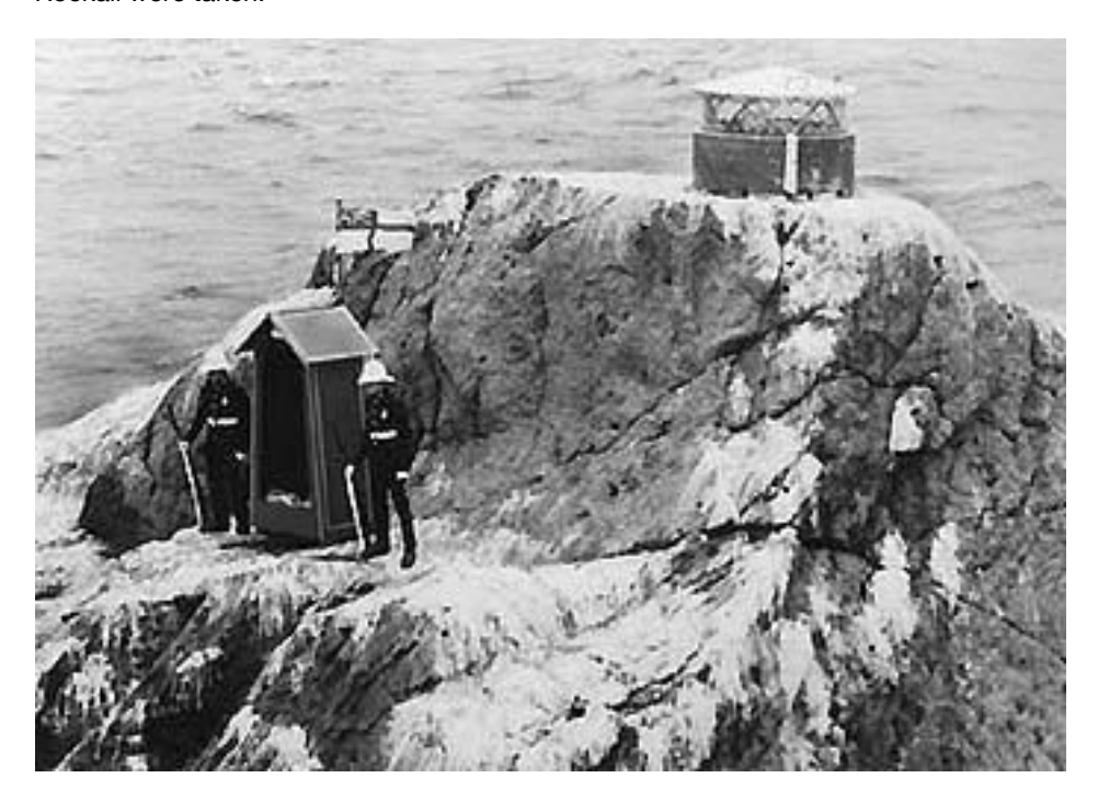
Figure 4 – British Royal Marines guard Rockall in 1974 (internet image, no copyright holder available)

Western Isles council when local government was reorganised in Scotland under the Local Government (Scotland) Act. In a practical demonstration of sovereignty, in 1974 HMS Tartar landed four servicemen on Rockall with, bizarrely, a sentry box and photographs of two Royal Marines in dress uniform standing by the box guarding Rockall were taken.